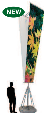
Wind Dancer Spire Conversion Kit UB714-C (indoor only)