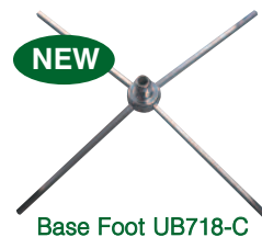
Base Foot UB718-C