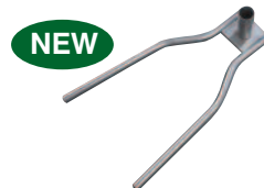
Drive-on Car Foot UB721-C