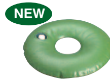
Weighting Ring UB719-C