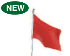
Wind Dancer Lanyard Conversion Kit UB715-C The Wind Dancer Conversion Kit allows you to attach a custom flag (see below) onto a Wind Dancer, converting it into a flagpole.