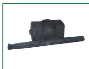
Bags for Wind Dancer UB716-C