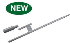
Ground Stake UB720-C