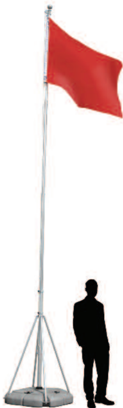
Wind Dancer 7.4m UB712-C (shown with optional Lanyard Kit)