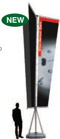
Wind Dancer Dart Conversion Kit UB713-C (indoor only)