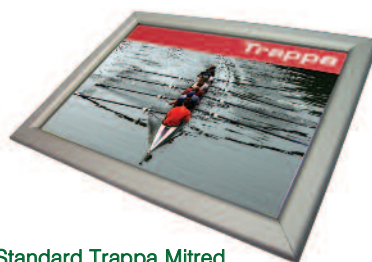
Standard Trappa Mitred 25mm Frame Codes AT401 – AT408