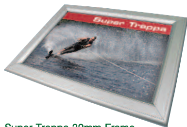
Super Trappa 32mm Frame (available in mitred only) Codes AT551 – AT555

Graphics can be quickly and easily changed