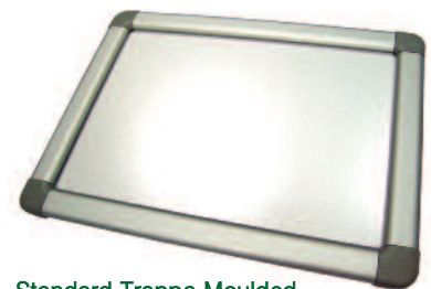
Standard Trappa Moulded 25mm Frame Codes AT401A – AT408A