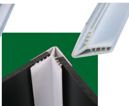
Fixed 60 degree - per metre (Code Ulex19)