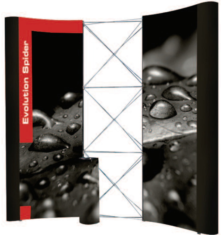
Code EK301SP (3x3 curved)