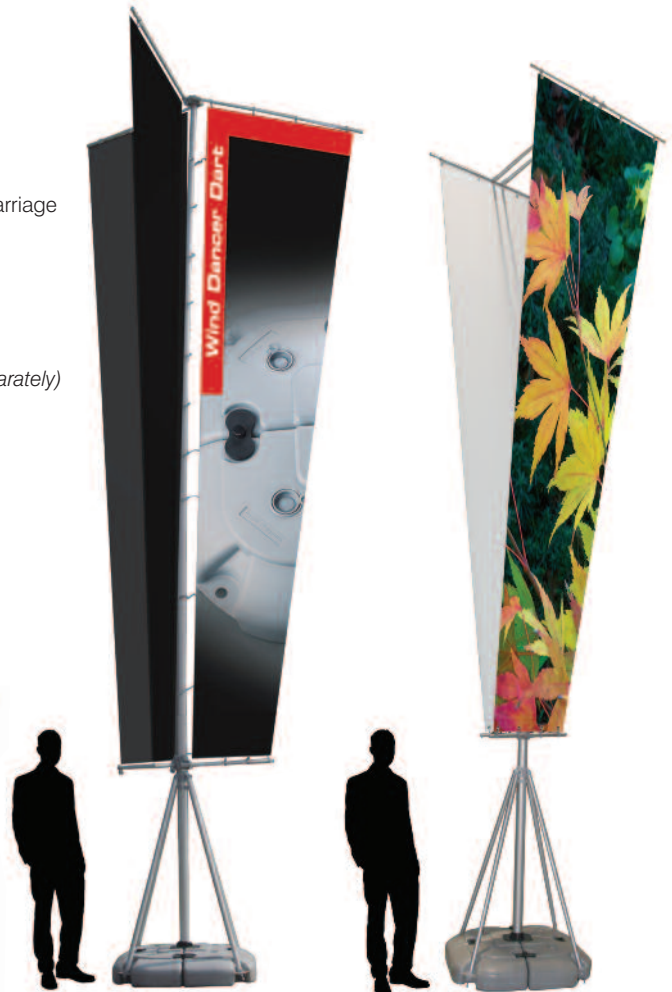
Wind Dancer Dart Conversion Kit UB713-C (indoor use only)