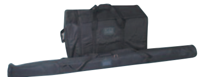
Bags for Wind Dancers available as optional extra