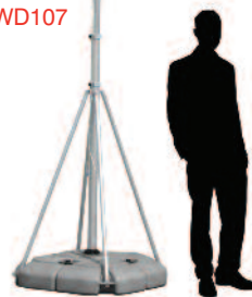
Wind Dancer Maxi 7.4m WD107

Wind Dancer Lanyard UB712-C The Wind Dancer Lanyard Conversion Kit allows you to attach a custom flag onto a Wind Dancer 5m (WD105), converting it into a portable flagpole.