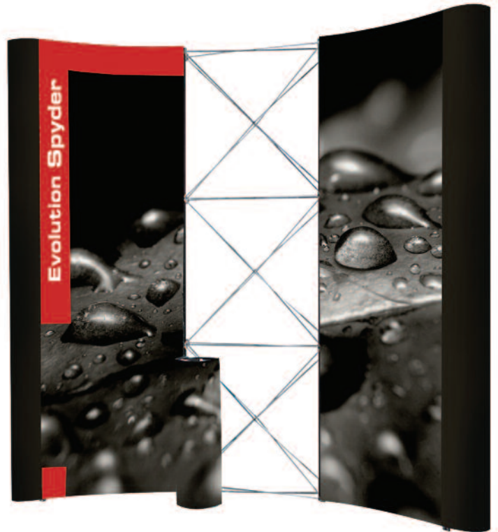
Code EK301SP-C (3x3 curved)