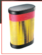
(Graphic wrap not included)