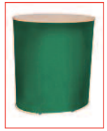
(Case to counter conversion)